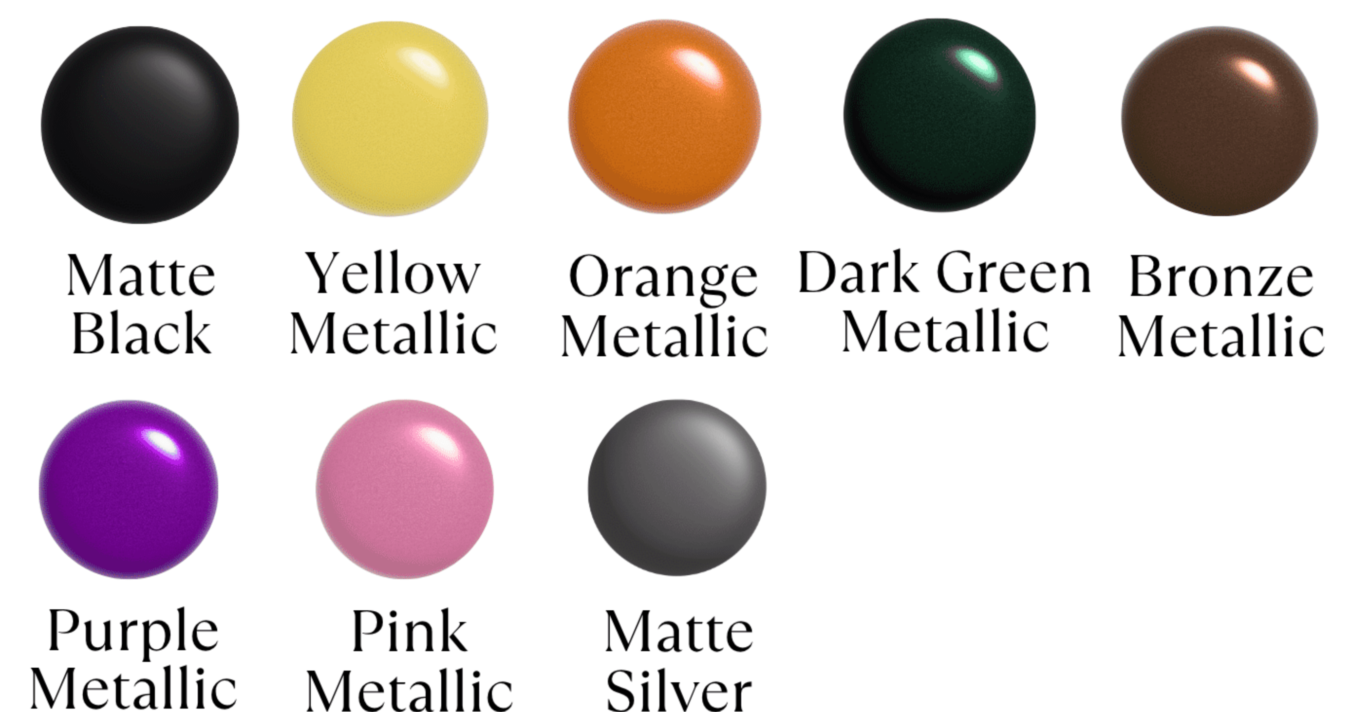
Matte Black Yellow Metallic Orange Metallic Dark Green Metallic Bronze Metallic Purple Metallic Pink Metallic Matte Silver